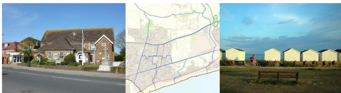
LANCING AND ITS PARISH COUNCIL